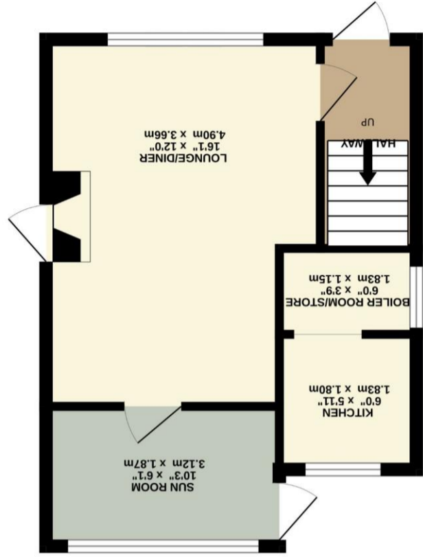
GROUND FLOOR 333 sq.ft. (31.0 sq.m.) approx.